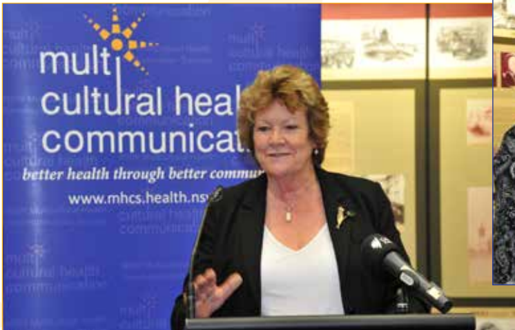
Health Minister Jillian Skinner delivers the keynote address at the NSW Multicultural Health Communication Awards

To view the winning multilingual health resources visit the MHCS website: www.mhcs.health.nsw.gov.au .