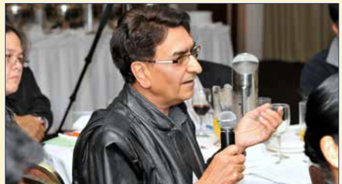
Doctors from the workshops were keen on learning how Get Healthy can help their patients

Visit www.gethealthynsw.com.au for more information about the free coaching line.