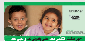
Arab Council Australia 02 9709 4333

For a free copy of the flipcharts, parents and carers of children aged 0-5 years from the Arabic, Chinese and Vietnamese communities can call the following community organisations below: