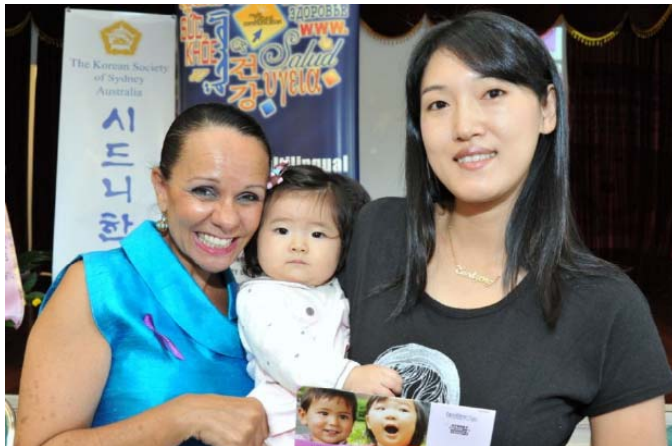
Mother and daughter thank Linda Burney for the new Korean flipchart

The English version of the resource in a flipchart format was first produced in 2006 by Families NSW to help parents give their children a good start in life. Titled 'Love Talk Sing Read Play', the flipchart is already available in three other community languages, Arabic, Chinese and Vietnamese, a project undertaken by the NSW Multicultural Health Communication Service.