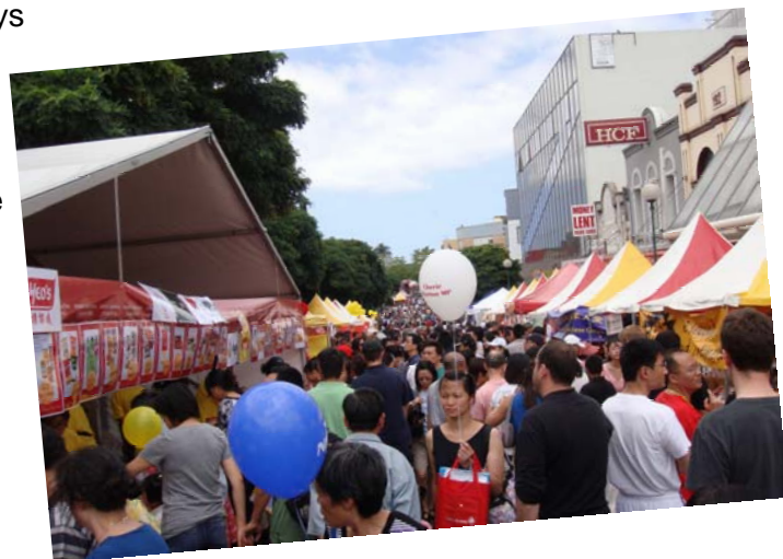
Hundreds enjoy the Chinese Festival at Hurstville Park